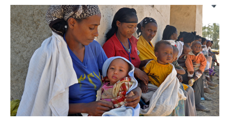
Children Believe engaged women and others in the communities to change perceptions about women's and children's health, and women's role in decision-making around health.

During our annual program review, beneficiaries were able to cite specific knowledge they gained about antenatal care, warning signs for pregnant women, hospital care, hygiene, infant and child health, and disease prevention. They were also able to say how they put this knowledge into action by adopting good hygiene practices, attending antenatal care services, going to hospitals for delivery, and sharing parenting roles between female and male partners. Beneficiaries also noted that community health committees established by our program have provided a useful platform to help and guide pregnant women.